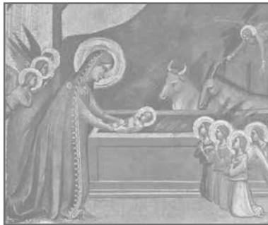
Cover image: "Birth of Christ" by Bernardo Daddi (1290-1348), circa 1325-1350. Part of the left panel of a triptych, oil on panel; collection of the Scottish National gallery.